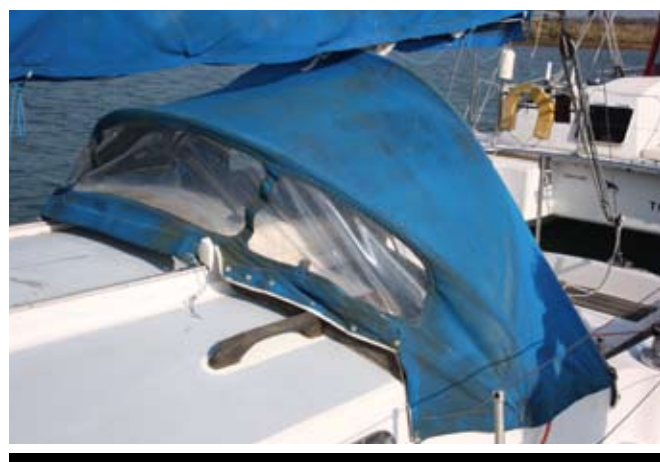
A very sorry state of affairs.